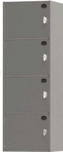
DLK24247204KNAA 24"Wx24"Dx72"H 4 Doors Keyed Lock