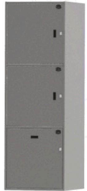
DLK30369012HNAB 30"Wx36"Dx90"H 1 Drawer, 2 Doors Hasp Lock