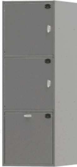
DLK24367212KNAA 24"Wx36"Dx72"H 1 Drawer, 2 Doors Keyed Lock