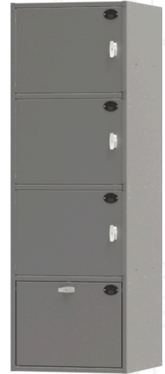
DLK24247213KNAA 24"Wx24"Dx72"H 1 Drawer, 3 Doors Keyed Lock