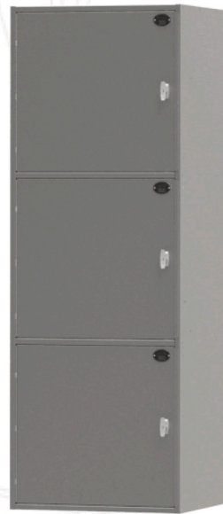
DLK30308403KNAA 30"Wx30"Dx84"H 3 Doors Keyed Lock