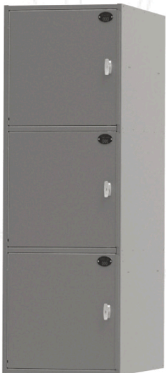
DLK24367203KNAA 24"Wx36"Dx72"H 3 Doors Keyed Lock